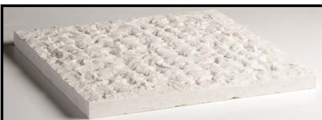
📍 Moav White Taltish

MOAV WHITE is a similar material, but with its unique shade it gives a strikingly different effect. The material is relatively new to the marketplace, and is increasingly becoming recognized and in demand.