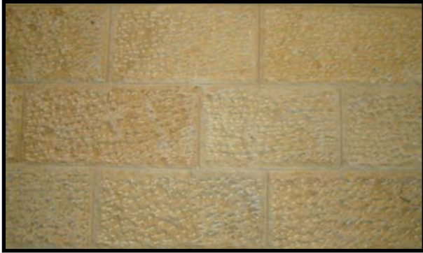
📍 Moav Taltish

We now turn the spotlight on MOAV . This material is becoming increasingly sought-after for interior floor coverings as well as outside flooring and wall cladding. Some of Moav's main attractive points are its consistency in texture and shade.